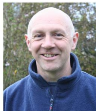
Tim Scott Vice Chair