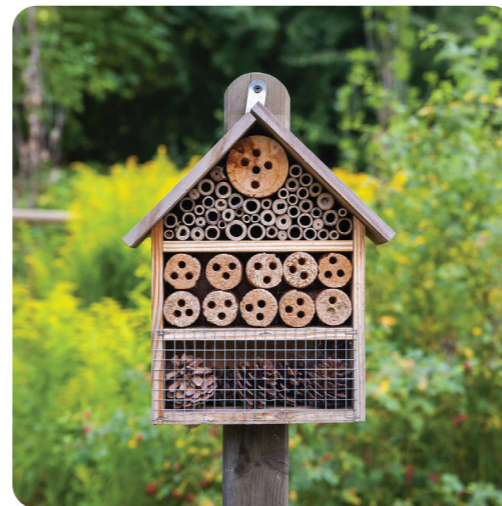
Insect Hotel - to be specified and located with guidance from designated Ecologist.