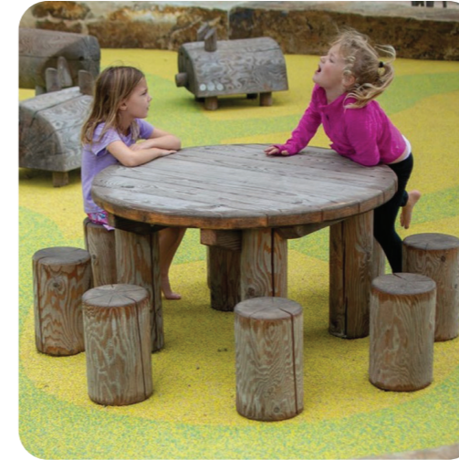
Seating type 2