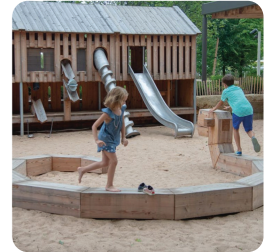
Informal Play Logs