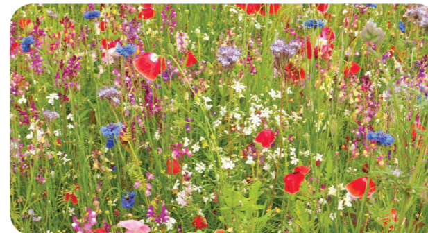
Application: Wildflower Meadow Mix: Flowering meadow (or similar) Location: All wildflower areas