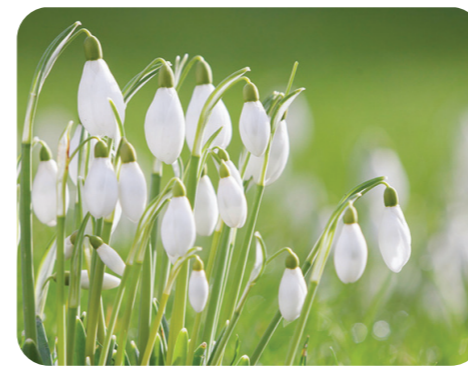
Galanthus nivalis (Flowering mid Jan - March)