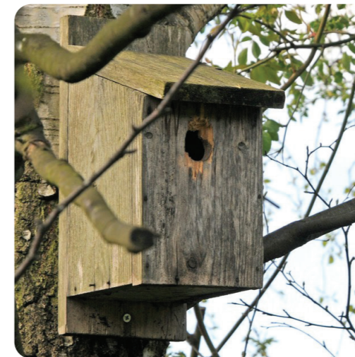
Bird Box - to be specified and located with guidance from designated Ecologist.