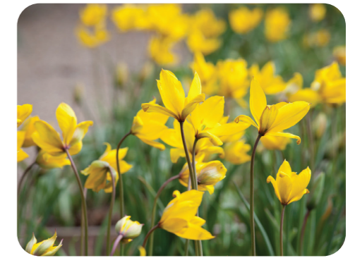
Tulipa sylvestris (Flowering April - May)