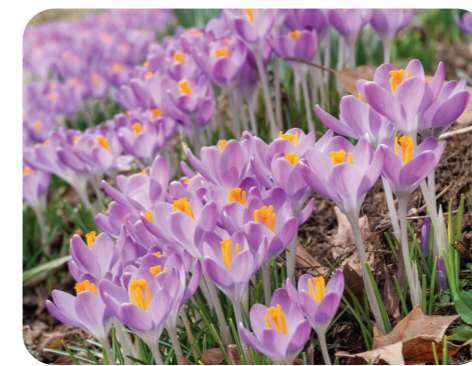
Crocus vernus (Flowering Feb - March)