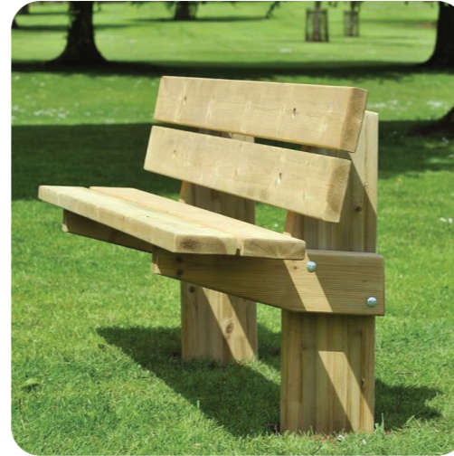
Seating type 1