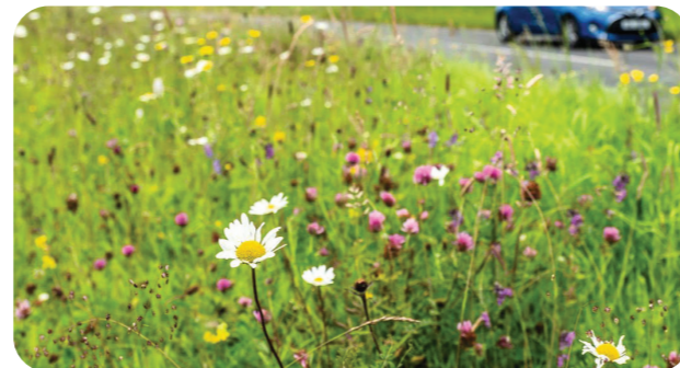
Application: Grass Verge Mix: Eco species rich lawn (or similar) Location: All grass verges