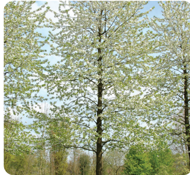
Latin name: Prunus Avium 'Plena' Common name: Wild Cherry Location: Key Junctions

Offering a wider variety of flowering mixes will not only help improve natural capital but will enhance the recreational space, providing more definition for all the local events. Planting Typologies will include Flowering Lawns, Wildflower Mixes, and Seasonal Bulb Planting. These will be supported with additional street trees where appropriate.