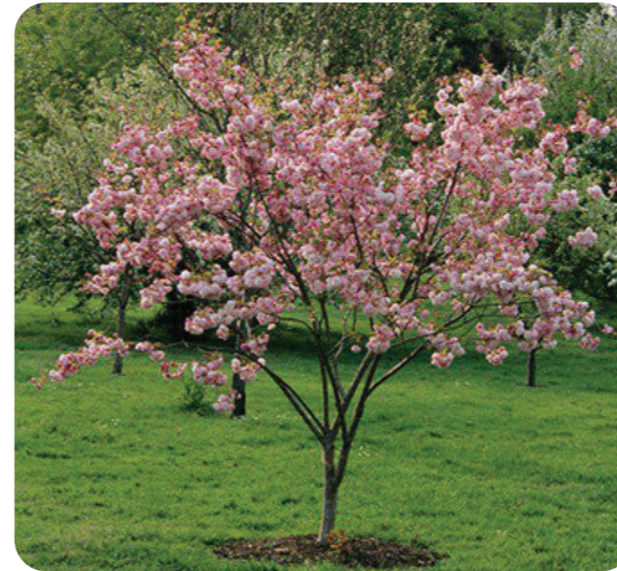
Latin name: Prunus 'Pink Perfection' Common name: Flowering Cherry Tree Location: Key Junctions