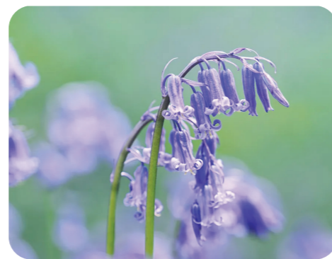
Hyacinthoides non-scripta (Flowering mid April - May)